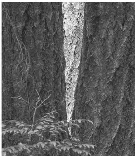
Light through mature fir trees in Banner Forest.

Native forests once dominated the landscape of the Great Peninsula. Though we have significantly altered or lost 98 percent of the original forest, we are still a region rich in forests. These forests of cedar, spruce, and fir support an intricate, self-sustaining environment. They also support timber jobs, clean our air and water, cool our cities in the summer, and provide recreation for our families. Now more than ever, conversion to residential