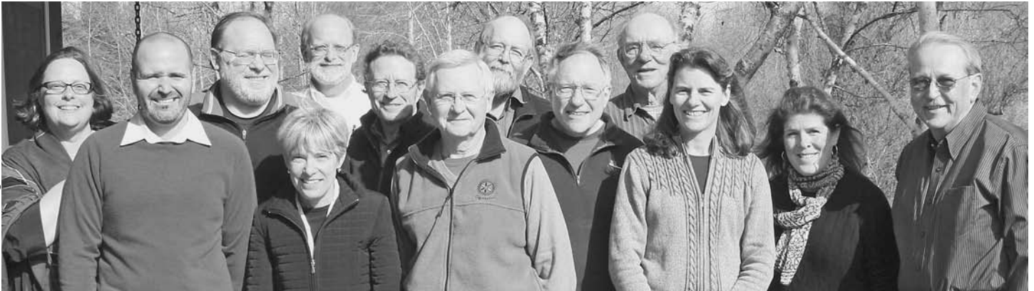
GPC Board and Staff at Spring Retreat.