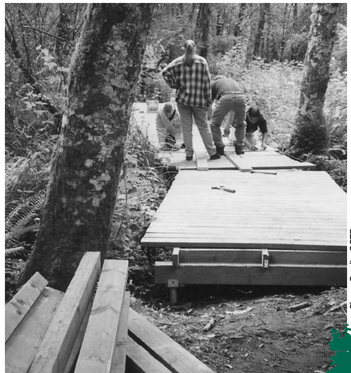
Volunteers construct boardwalk on Clear Creek Trail.

Great Peninsula Conservancy has a long history of conserving the special green spaces in our communities from the Indianola Greenway and Silverdale's Clear Creek Trail to the many family-owned natural lands we protect through conservation easements. Many of these successes happen through community partnerships and the initiative of neighbors who act as long-term stewards for the land.