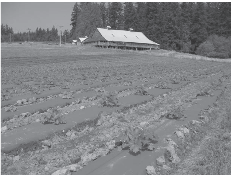
Crops on Petersen Farm.