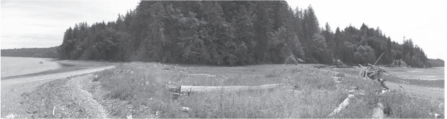
Tekiu Point, Hood Canal.