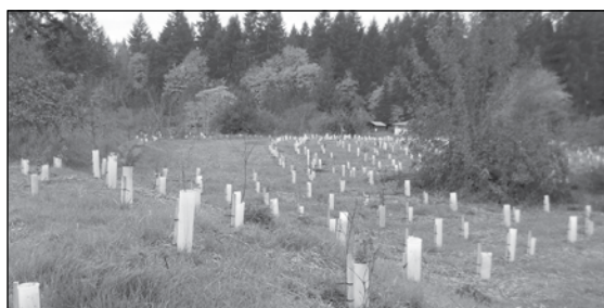
From a distance it looks like a cemetery but it's really plastic sleeves that protect thousands of new native plants on the Klingel Wetland.

Now that the planting is done a new fence is being constructed with funds from US Dept of Agriculture to protect the new plantings and limit access to the newly restored salt marsh to foot traffic. Come spring GPC plans on installing interpretive signage, the final phase in an eight year restoration project.