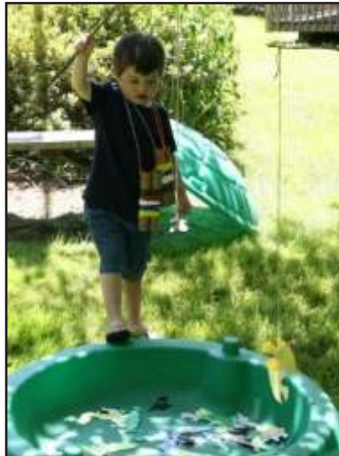
Fishing fun at Clear Creek Trail Family Day.

All events will be held at the Clear Creek Saq'ad Interpretive Center, Bucklin Hill and Levin Roads. For complete details, log on to www.clearcreektrail.org or email us at clearcreektrail@yahoo.com .