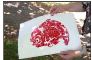
And fish printing too!